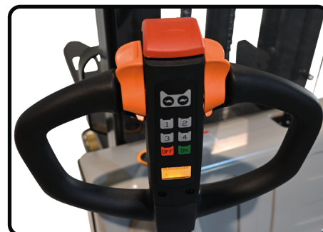
All models equipped with PIN code lock.