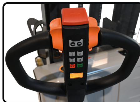
All models equipped with PIN code lock.